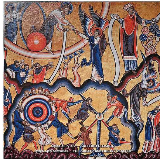
From the Great Canterbury Psalter

My soul delights · in the Lord my God. O Lord, save me, shield my soul from temptation's call, and close the gates of hell continuously before me. My heart is broken, my spirit is contrite. Don't seal the gates to your holy righteousness, of your perfect rectitude, for I walk in your path, on your plain road. O Lord, wrap me · in the robe of your righteousness! Help me to flee, to escape from my foes; ease my flight, free the way before me. I trust in you always, not in the arm of flesh; you are merciful and generous, you are gentle and kind; when I ask, you give, when I knock, you open. I raise my voice · to the rock of my righteousness.