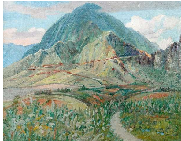
The Pali by D. Howard Hitchcock, 1861–1943.

Justice and judgment are joined at Your throne; mercy and truth are Your twin attendants. Blest are the feasters in their festal shouts; the light of Your face illuminates their walk. They exult in Your name from morn till night; their reverent joy extolls Your righteousness. Your awesome glory arms their victory; Your favor to their king kindles their praise. For our shield belongs to the Lord our God; our king lives to serve our Holy Savior.